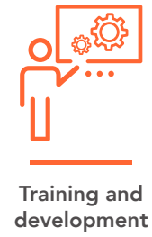
Training and development

Our Mutual Benefits Program offers EML customers access to innovative tools, training and services designed to improve outcomes for employers, workers and the communities we support.