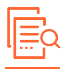
Insights and best practice